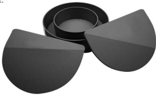
ACO plastic channel accessory kit*

To download the product images please visit: https://we.tl/t-LxFmH5eHj6