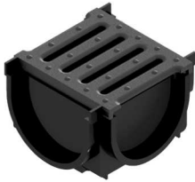
ACO plastic channel corner unit

ACO Water Management Contacts: Sales: customersupport@aco.co.uk Technical: technical@aco.co.uk Tel: 01462 816666 www.aco.co.uk